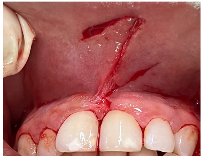
Figure 4: Two horizontal incision at 60° to the vertical incision.