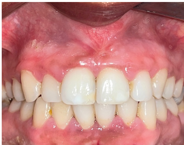
Figure 10: Six month follow up.