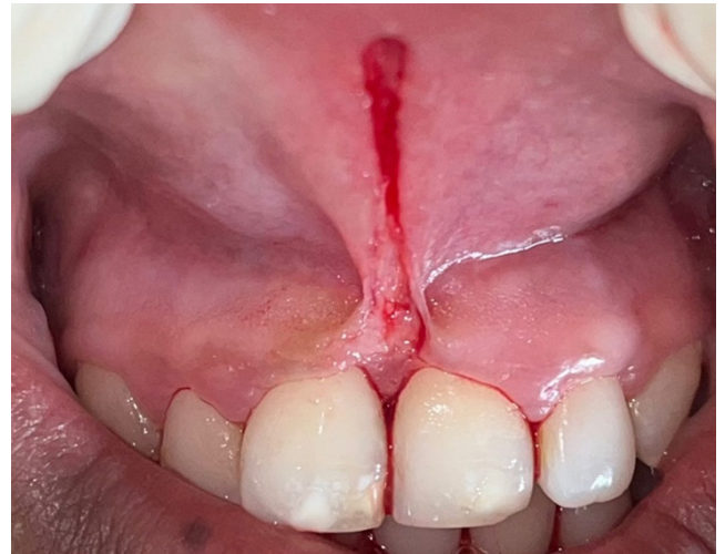
Figure 2: Vertical incision given along the length of the frenum.