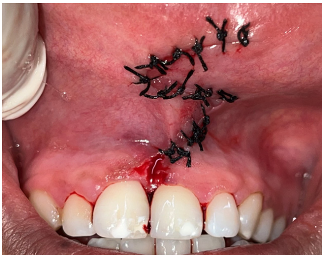
Figure 7: Flaps stabilised by interrupted suture.