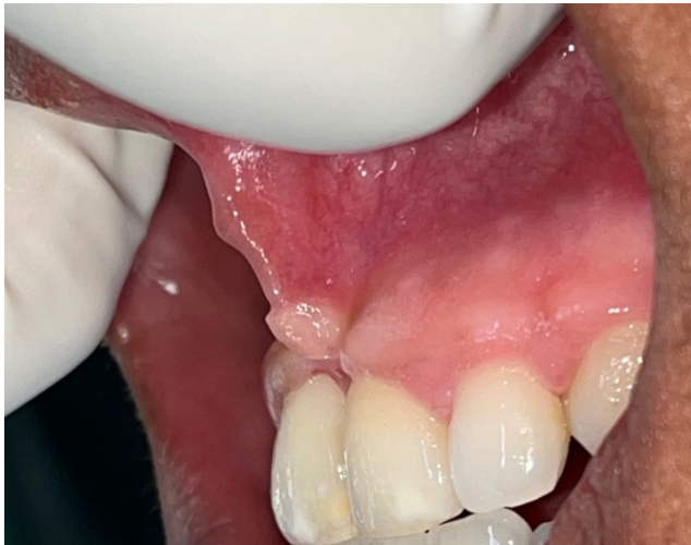
Figure 1: Lateral view of papillary maxillary frenum.

given. Patient was advised to refrain from brushing at the surgical site for two weeks. Patient was prescribed 0.2% chlorhexidine gluconate mouthrinse twice daily for 10 days and analgesics were prescribed (combination of ibuprofen 400 mg and paracetamol 325 mg) for two days then, if required. The sutures were removed in two weeks (Figure 8). On recall after one month, healing was uneventful with minimal scar formation (Figure 9). After six months, no hypertrophic scar was observed with excellent tissue match (Figure 10).