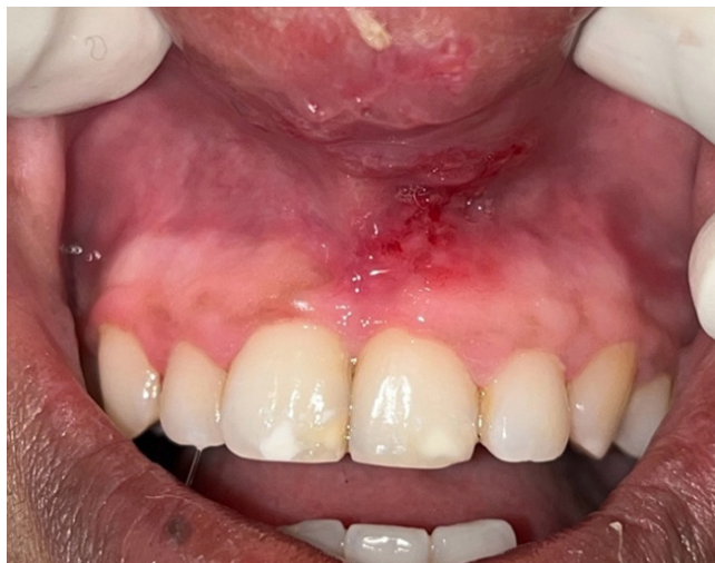
Figure 8: After suture removal in two weeks.