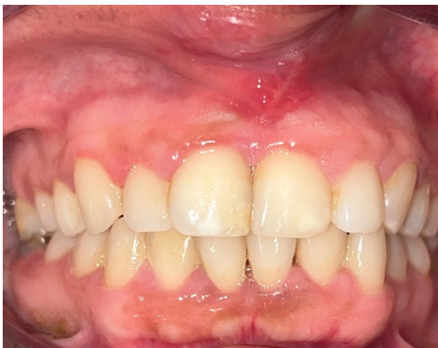
Figure 9: One month follow up.