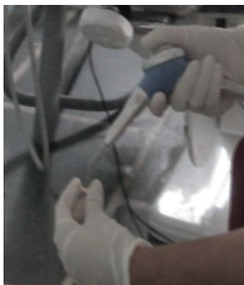
Figure 6b: Air-polishing of extracted teeth