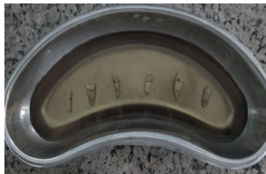
Figure 5b: Teeth stained in coffee solution