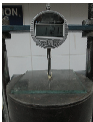
Figure 3: Digital Micrometer