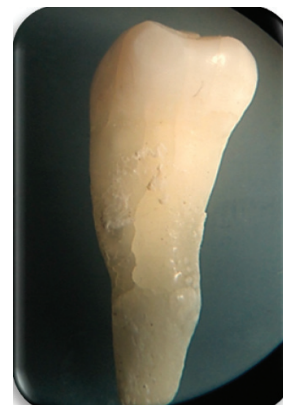
Figure 7b: Root surface under stereomicroscope post-procedural

during maintenance therapy (Figure 5a and 5b). The powder chamber of the Prophy-Jet was filled with the air-polishing powder (glycine or chlorhexidine acetate) and air-polishing was carried out. The Prophy-Jet was connected to 70 psi of compressed air and water supply of 50 psi and was directed towards the sample at 45 degrees in a sweeping motion. 2 (Figure 6a and 6b)