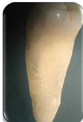
Figure 7a: Root surface under stereomicroscope pre-procedural