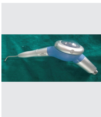
Figure 6a: Prophy-Jet air abrasive system