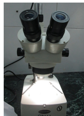
Figure 4: Stereomicroscope