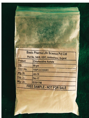
Figure 2: Chlorhexidine acetate powder