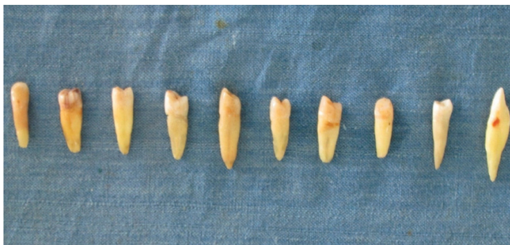
Figure 5a: Extracted teeth specimen