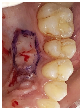
Figure 3: Area demarcated to be harvested for grafting.