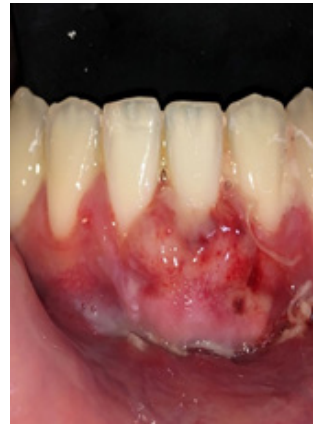
Figure 7: Post-operative healing.