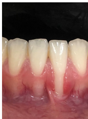
Figure 1: Preoperative view.

A 23-year-old female patient came to the clinic with chief complaint of receding gums in lower front tooth. Upon inspection, gingival recession was observed in the region of 31 (according to two-digit numbering system). The patient was scheduled to undergo mucogingival surgery. Before any incisions, the exposed root surface was carefully scaled and root planed. A 3-4 mm wide recipient connective tissue bed was prepared apical and lateral to the recession defect.