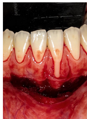
Figure 2: Vestibular extension done.