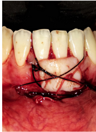
Figure 6: Sutures in place.