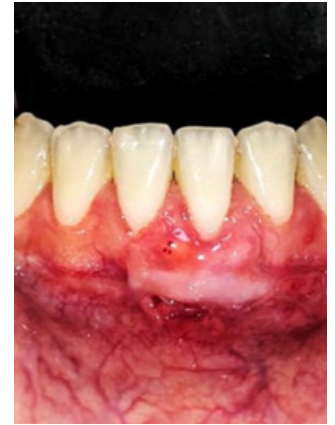
Figure 8: Healing after 15 days.

interdental tissue to a level approximately 4-5 mm apical to the recession, were placed. A horizontal incision was then made connecting the two vertical incisions at their apical termination. Starting from an intracrevicular incision, a split incision was made to sharply dissect the epithelium and the outer portion of the connective tissue within the demarcated area.