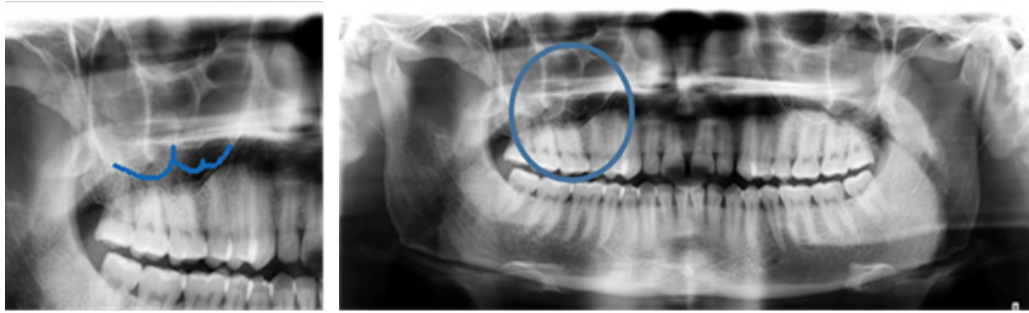
Figure 1: Panoramic radiograph showing septa in maxillary sinus.