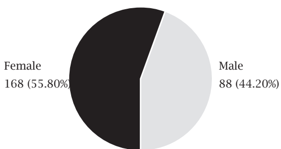
Figure 1: Genderwise distribution of participants.

Altogether 301 participants participated in study, among them 168 (55.8%) were female (Figure 1), out of which 263 (87.4%) were literate and 38 (12.6%) were illiterate