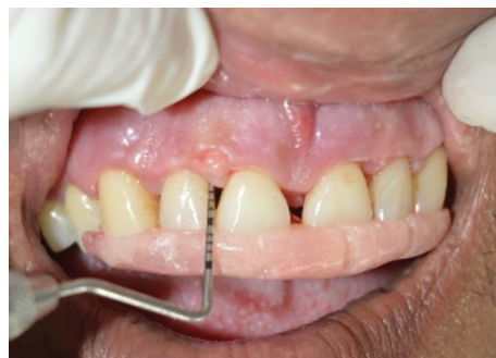
Figure 3: PPD and CAL recording with the stent and UNC-15 probe.

and 6 months were 6.23 mm, 5.29 mm and 4.36 mm, respectively and mean change from baseline to 3 months and baseline to 6 months were 0.94 mm and 1.87 mm, respectively. Similarly, in the OFD group, the mean PPD at baseline, 3 and 6 months were 6.22 mm, 5.14 mm and 4.17 mm, respectively and mean change from baseline to 3 months and baseline to 6 months were 1.07 mm and 2.04