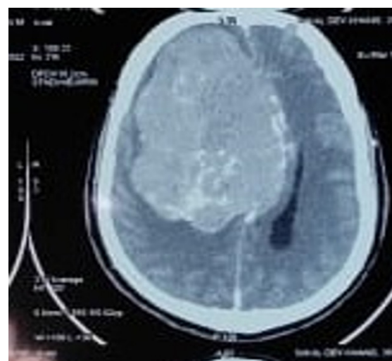
Figure 4: CECT showing large meningioma.

sequence in axial plane was done in 19 cases to rule out space occupying lesion in cerebello-pontine angle and vascular conflict induced demyelination. There were eight (5%) classical cases and three (3.75%) secondary cases (Figure 3, 4)