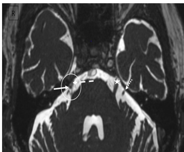
Figure 3: MRI T2 weighted (axial) image.