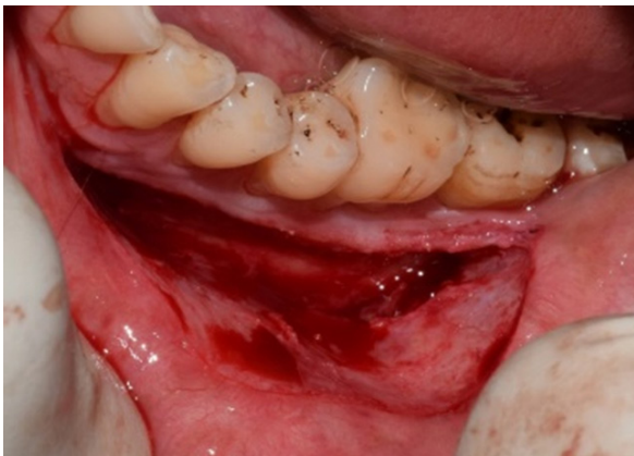
Figure 3: Horizontal incision placed at mucogingival junction followed by suprapariosteal dissection.