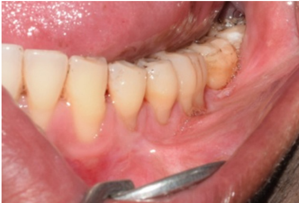
Figure 1: Shallow buccal vestibule with inadequate attached gingiva in left posterior mandibular region.