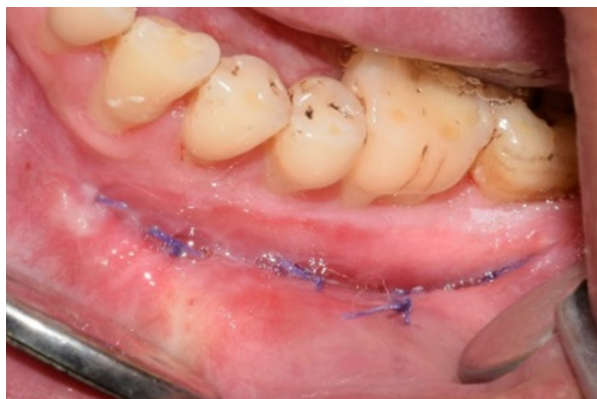
Figure 6: After two weeks of vestibuloplasty.