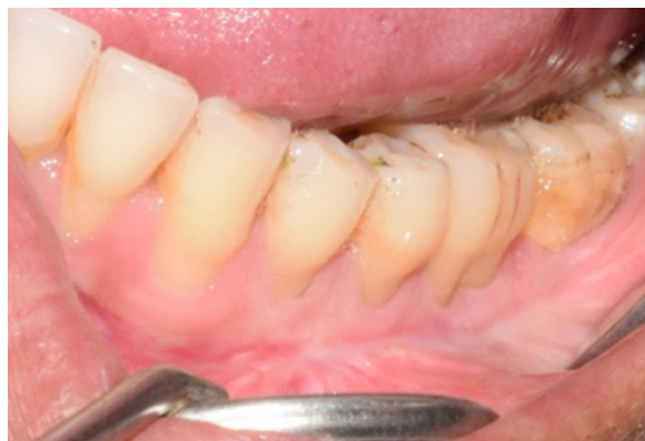
Figure 7: After three months of vestibuloplasty.