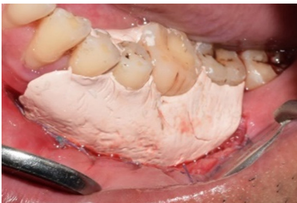
Figure 5: Coe-pack placed over raw areas on alveolar bone.